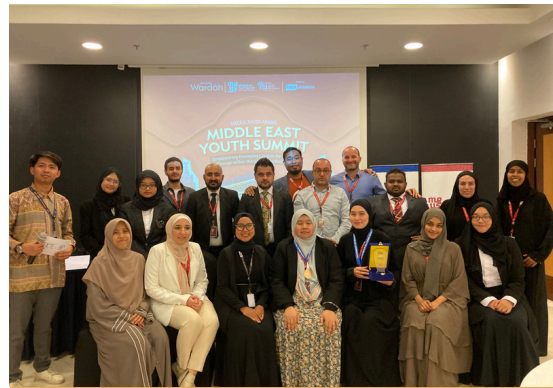
September 19-22, 2023: Building World Civilization through Islamic Brotherhood