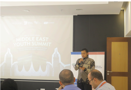
February 19 - 22, 2024: Empowering Emerging Leaders for Positive Change within the Islamic Brotherhood