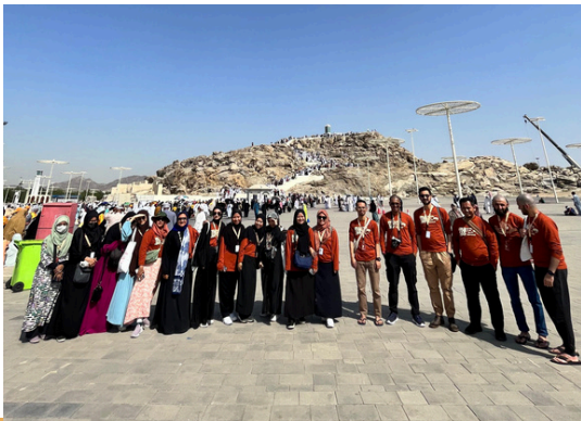
February 28 - March 3, 2023: Building Future Muslim Leaders