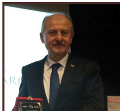
Hasan Suven Mayor of Fatih Municipality (2019)