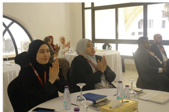
February 19 - 22, 2024: Empowering Emerging Leaders for Positive Change within the Islamic Brotherhood